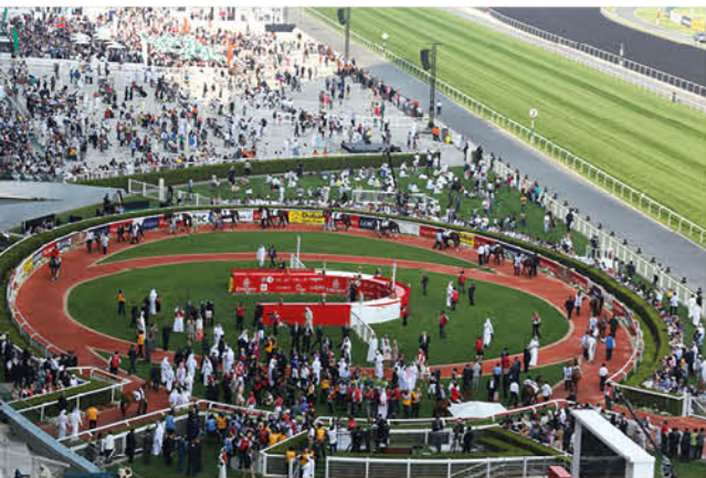
美丹馬場的馬匹亮相圖畫後美奐。 Paddock of Mayden was full of star runners.

杜拜世界盃總獎金1000萬美元，既為全球最高價值賽事，除第一場阿拉伯馬賽事Dubai Kahayla Classic，膠沙地2000米，總獎金25萬美元，其餘各場100至1000萬美元不等；重賞當前，大家不妨坦承向錢看！姚廠「崇山寶」於總獎金100萬美元的阿喬斯短途錦標1000米草地先拔頭籌，頭馬獎金60萬美元；杜拜金莎軒錦標膠沙地1200米，總獎金200萬美元，摩廠「練力之城」獲120萬美元，杜利茶座騎「好好計」獲亞軍，獎金40萬美元；司馬經典賽總獎金200萬美元，摩廠「多名利」得第五，獎金15萬美元，及「事事為王」於杜拜世界盃膠沙地2000米，得第五，獎金30萬美元，港隊共捧走265萬美元，折合高達2000萬港元，實際還未只此數計，另一香港馬主，前馬會主席夏佳理名下「紅色禮物」，於總獎金1000萬美元杜拜世界盃得第六名，也有20萬美元獎金。稍稍美中不足，是香港馬會CEO應家柏名下Now We Can，於杜拜金盃（Dubai Gold Cup）際遇與「將男」同樣差勁，大半程於外檔找不到遮擋，費力甚多下大敗而回，反而與Now We Can同場，