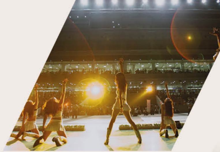
韓國娛樂事業發達，場內又怎會少得歌舞表演。 With the prosperous entertainment industry in Korea, it is not surprising to find singing and dancing performance in the racecourse.

最後，韓國馬事會為確保提供質素優良的賽駒，極力發展純種馬的育馬事業。透過從世界各地引入頂級的種馬，韓國近年已可以提供由本地生產的優秀兩歲賽駒。而從一系列的種馬中，來自美國的「萬里飛」(Menifee)是目前的冠軍種馬，旗下子嗣於2012年合共勝出64場頭馬，而最近更購入兩匹美國種馬「搖滾樂隊」(Rock Hard Ten)