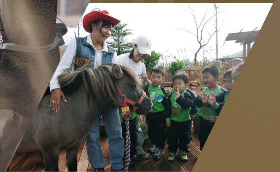
馬場內亦安排設施讓小朋友與小馬近距離接觸。 There is a petting area for kids to closely interact with ponies.

Among the three racecourses in South Korea, Busan Race Course is the newest one equipped with the most modern facilities. The management board endeavours to establish it as the world's best horse theme park. Apart from the horse racing facilities, the directors also stressed the development of the six theme parks in the racecourse – an investment of more than US$81.8 million was spent on upgrading the park, which is becoming more entertaining. Recently, the racecourse has become a famous tourist attraction as the admission to this unique racing park is only US$2.