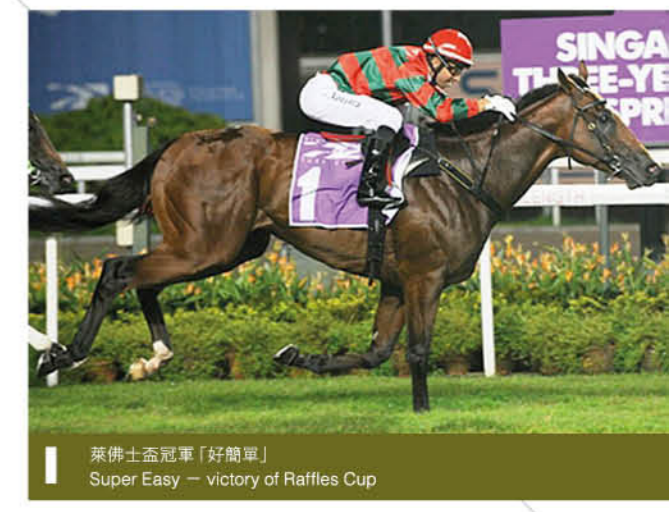
萊佛士盃冠軍「好簡單」 Super Easy — victory of Raffles Cup