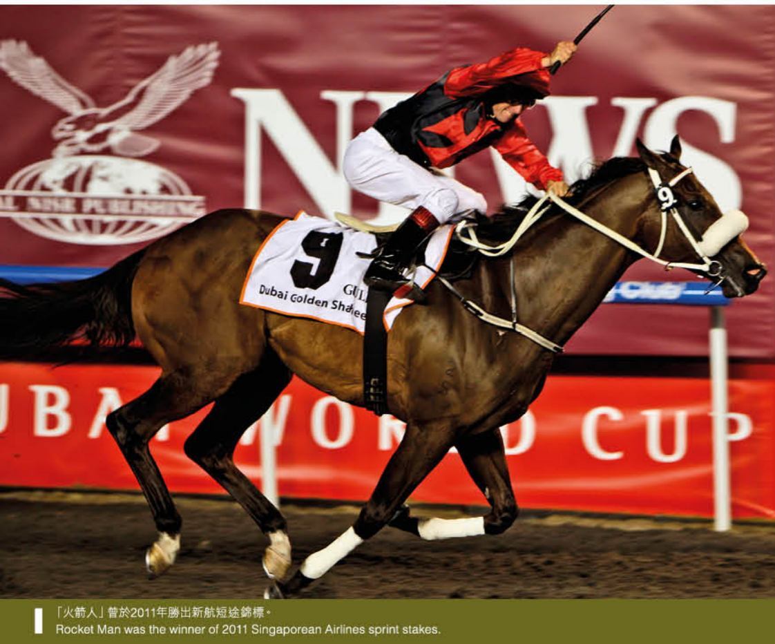
「火箭人」曾於2011年勝出新航短途錦標。 Rocket Man was the winner of 2011 Singaporean Airlines sprint stakes.

其他外隊馬匹方面，較為受注目的是澳洲多項一級賽冠軍「變革時機」(Moment Of Change)，以及剛勝出一級賽佐治萊特錦標的「拜倫勳爵」(Gordon Lord Byron)，不過近年澳洲短途水準大幅下降，去年的「神速寶駒」(Bel Sprinter) 也被「天久」拋離甚遠，看來要威脅香港隊這批短途精英，非要再進一步不可。另外名單中有不少在金莎軒錦標及阿喬斯短途錦標中列陣的馬匹，包括愛爾蘭代表「百望豐盛」(Balmont Mast) 及「俄國精神」(Russian Soul)，英國代表「意國貴族」(Medicean Man)、阿聯酋代表「繽紛色彩」(United Color) 等，且看這些馬匹能否在今戰重振聲威。