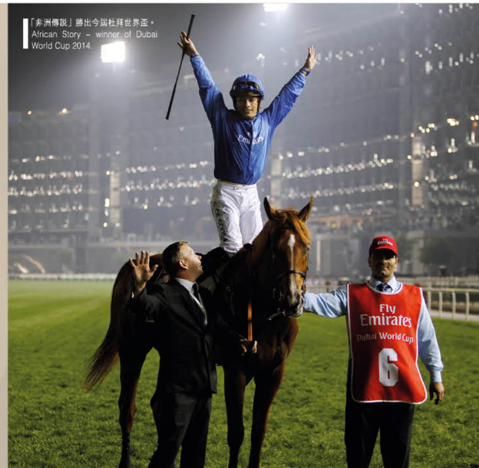
「非洲傳說」勝出今屆杜拜世界盃。 African Story - winner of Dubai World Cup 2014.