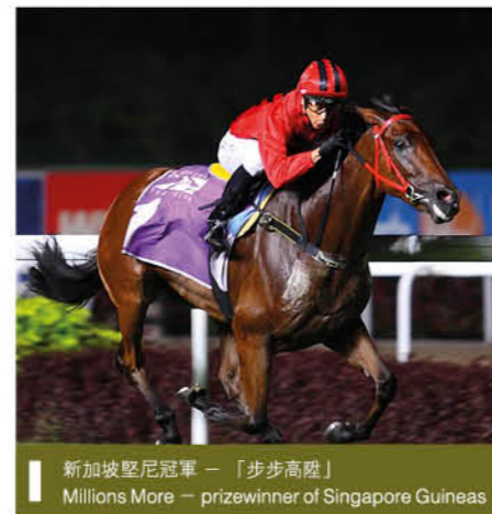
新加坡堅尼冠軍 — 「步步高陞」 Millions More — prizewinner of Singapore Guineas

Aside from Military Attack, other Hong Kong horses include Dan Excel, who was placed second last season; Akeed Mofeed, fifth in the Dubai World Cup; Blazing Speed, unlucky in the Duty Free Cup; and Designs On Rome, winner of the Hong Kong Derby ... all heading up a very strong team of Hong Kong runners. Dan Excel and Akeed Mofeed have already proven their ability to win overseas and it is estimated that both horses will first challenge the QE II Cup before going to Singapore. Hong Kong certainly has what it takes to win the race again.