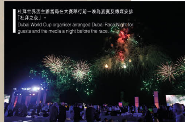
杜拜世界盃主辦當局在大賽舉行前一晚為嘉賓及傳媒安排「杜拜之夜」。 Dubai World Cup organiser arranged Dubai Race Night for guests and the media a night before the race.

到全晚焦點杜拜世界盃，上陣馬多達十六駒，數量乃歷年之冠，威靈的港日兩地，分別以「事事為王」、「軍事出擊」及「巴比倫王」(Belshazzar)、「北港火山」(Hokko Tarumae) 雙龍出海，可是今回猛虎不及地頭龍，主場阿聯酋出馬多達七匹，其中兩位油王馬主威頓酋長的「埃塞王」(Mukhadram) 及高多芬馬房 (Goldolphin) 名下「非洲傳說」(African Story) 應聲彈出，未幾「埃塞王」上前帶離四馬位之先，「非洲傳說」、「北港火山」及「希臘小子」(Ron The Greek) 三駒如影隨形，牽連「事事為王」固守內欄第六位，「軍事出擊」則留居兩乘之後。入直路「埃塞王」率先透出，但「非洲傳說」在高多芬主帥蘇萊兆輝 (Silvestre De Sousa) 輕催下迅即飄離，「埃塞王」穩獲亞席，高多芬另一駒「山貓」(Cat O'Mountain) 第三，阿聯酋包辦三重彩，練馬師蘇萊在頒獎台上神態自若，反觀平日相當嚴肅的穆罕默德酋長 (Sheikh Mohammed)，喜形於色的手舞足蹈，還展示勝利手勢，其實這也可以理解，高多芬於2012年憑Monterosso「蒙泰羅索」於此賽報捷，去年則落入美國代表Animal Kingdom「動物王國」手上，今重奪獎座焉能不高興！