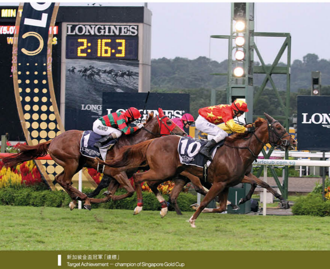
新加坡金盃冠軍「達標」 Target Achievement — champion of Singapore Gold Cup

香港隊報名馬除了「軍事出擊」外，上屆亞軍「花月春風」也有在名單之中，加上在杜拜世界盃取得第五名的「事事為王」，於杜拜免稅店盃中未竟全功的「將男」，以及香港打吡盟主「威爾頓」，香港隊可說是強勢出擊。尤其是「花月春風」及「事事為王」兩駒，均已經在外地證明了本身擁有爭雄的威力，預計兩駒均會先出戰愛彼女皇盃，然後才向這場賽事進軍。從這個陣容所見，香港隊絕對有力成功衛冕這項賽事。