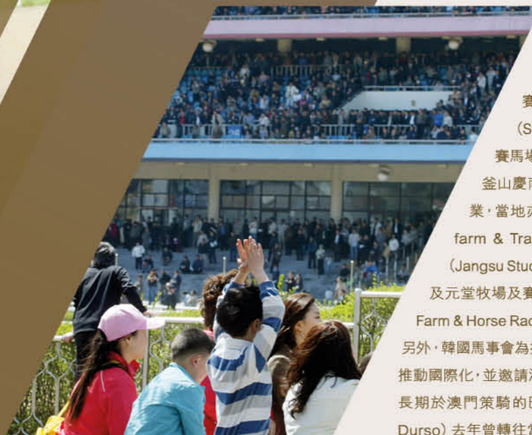
馬場看台氣氛熱鬧。 The atmosphere is intense in the Grandstand.