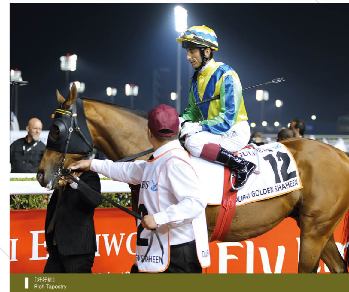
「好好計」 Rich Tapestry