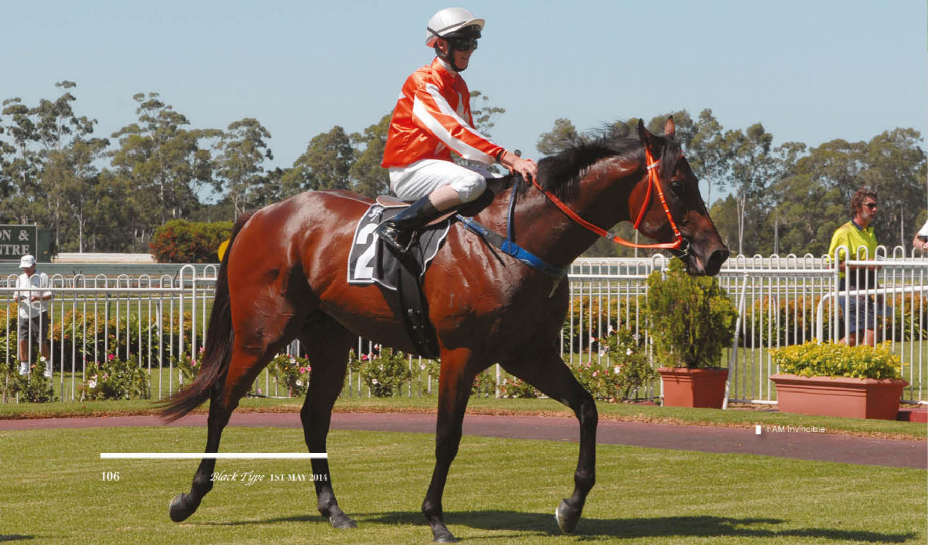
I AM Invincible

育馬業一向以來都是循環不息，有老種馬退下來的同時，也有新種馬加入。今年有不少新種馬的子嗣投入競賽行列，現時全部屬於兩歲馬，在此作個初步的結算，看看哪匹首季種馬在澳洲稱王。