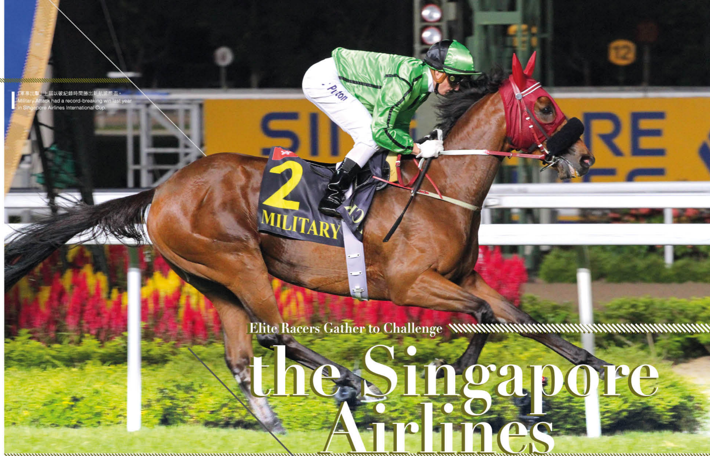
「軍事出擊」上屆以破紀錄時間勝出新航國際盃。 Military Attack had a record-breaking win last year in Singapore Airlines International Cup.