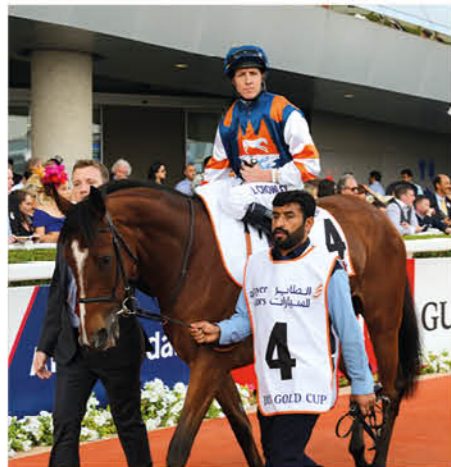
■ Moment in Time

全晚重頭戲落在五場國際一級賽, 首個高潮由阿喬斯短途錦標掀起, 上屆冠軍「謝謝您」(Shea Shea) 挾美丹馬場草地1000米紀錄保持者之勢而來, 與同屬此道強項「崇山寶」賽前一時瑜亮, 賽前各界預期雙雄單打獨鬥, 贏面則不相伯仲, 起步「崇山寶」從八檔應聲掙出, 莫雷拉大概參考過此賽各盟主制勝策略, 跑過200米逐步取道看台方向較有利場地, 「謝謝您」則一如勝時出閣落後, 鞍上人蘇銘倫再努力進取, 仍居後徐徐追趕, 末段「崇山寶」帶離下仍游刃有餘, 英國代表「阿頭」(Ahtoug) 始終力拚不逞, 「謝謝您」更嫻嫻來遲無法挑戰, 兩駒分獲二、三名, 「崇山寶」一放到底, 並以56秒21打破「謝謝您」締造時間刷新此程紀錄, 港隊另一駒「時尚風采」畢竟年事已高, 在最佳拍檔都爾勝下得第八, 練馬師告達理賽後表示, 這匹十歲馬將運返紐西蘭頤養天年, 那邊廂「崇山寶」馬主洪金寶像未相信眼前所見, 緊握雙拳不停叫喊,