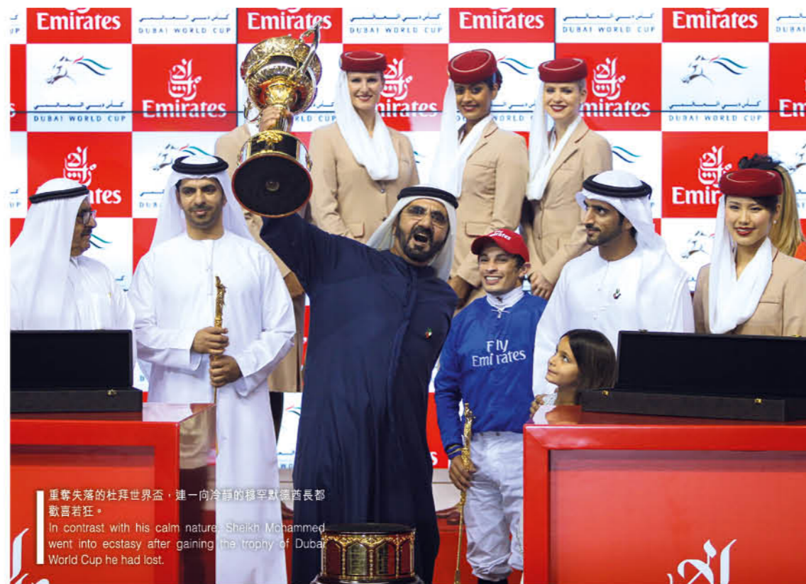
重奪失落的杜拜世界盃，連一向冷靜的穆罕默德酋長都歡喜若狂。 In contrast with his calm nature, Sheikh Mohammed went into ecstasy after gaining the trophy of Dubai World Cup he had lost.