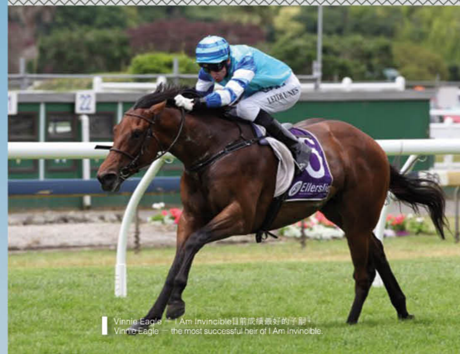
Vinnie Eagle — I Am Invincible目前成績最好的子嗣！ Vinnie Eagle — the most successful heir of I Am Invincible.