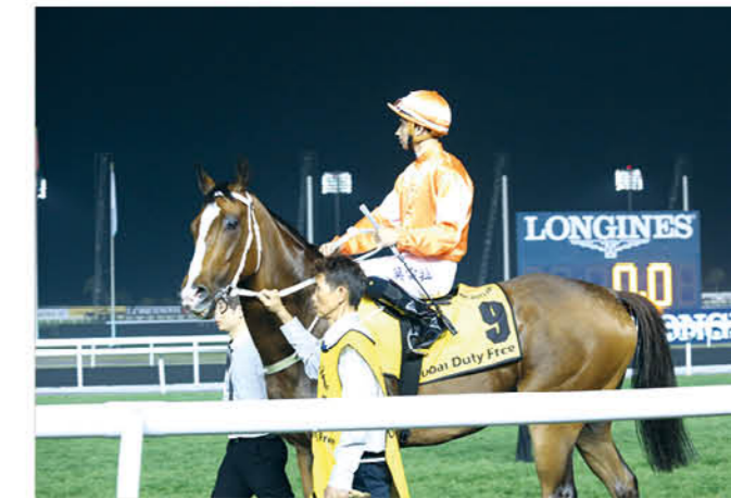
「將男」表現欠佳，只能以第十名衝線。The underperforming Blazing Speed finished tenth.

team, which lifted the trophy of Dubai World Cup in 2011. Vercingetorix under Christophe Soumillon came second. Last year, Tokei Halo and The Fugue ran second after Akeed Mofeed and Dominant in Hong Kong Cup and Hong Kong Vase respectively, yet in this race they were just the seventh and eleventh due to the mediocre performance. Blazing Speed, although saddled by star rider Moreira, finished only tenth. Trainer of Just A Way Yuichi Fukunaga is young but experienced – he was a jockey of Japan Racing Association, and before this race he had already 7 G1 wins, including that on Gold Ship in Takarazuka Kinen 2013; the success of Just A Way is no fluke, as the runner's talent had been proved in winning Tenno Sho Autumn last autumn.