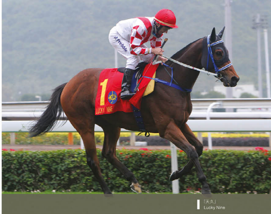
「天久」 Lucky Nine