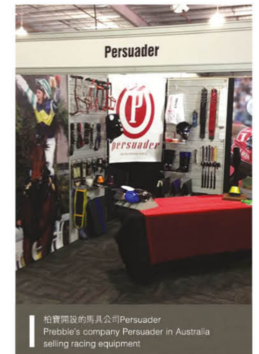
柏寶開設的馬具公司Persuader。Prebble's company Persuader in Australia selling racing equipment.