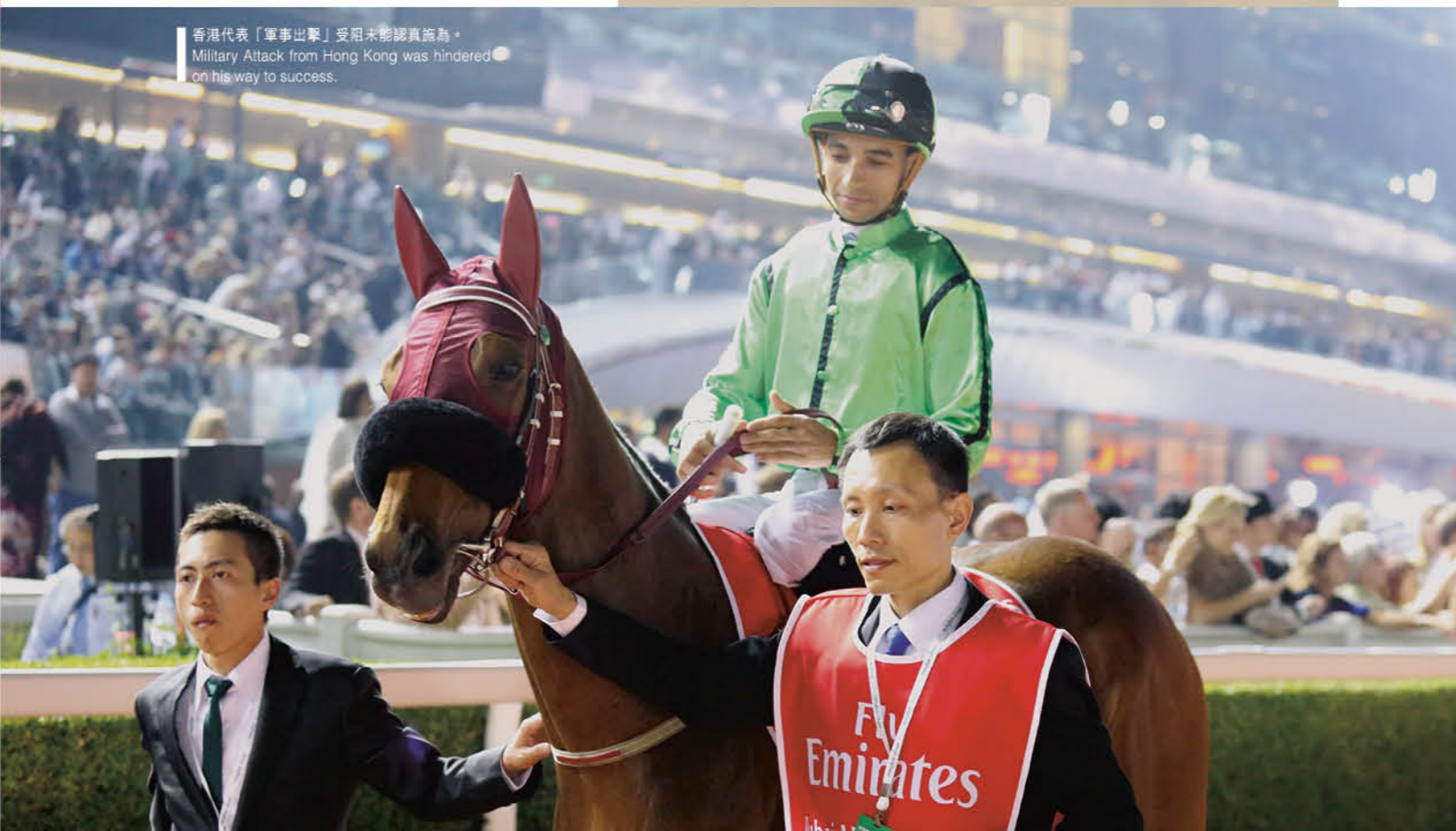
香港代表「軍事出擊」受阻未能認真施為。 Military Attack from Hong Kong was hindered on his way to success.