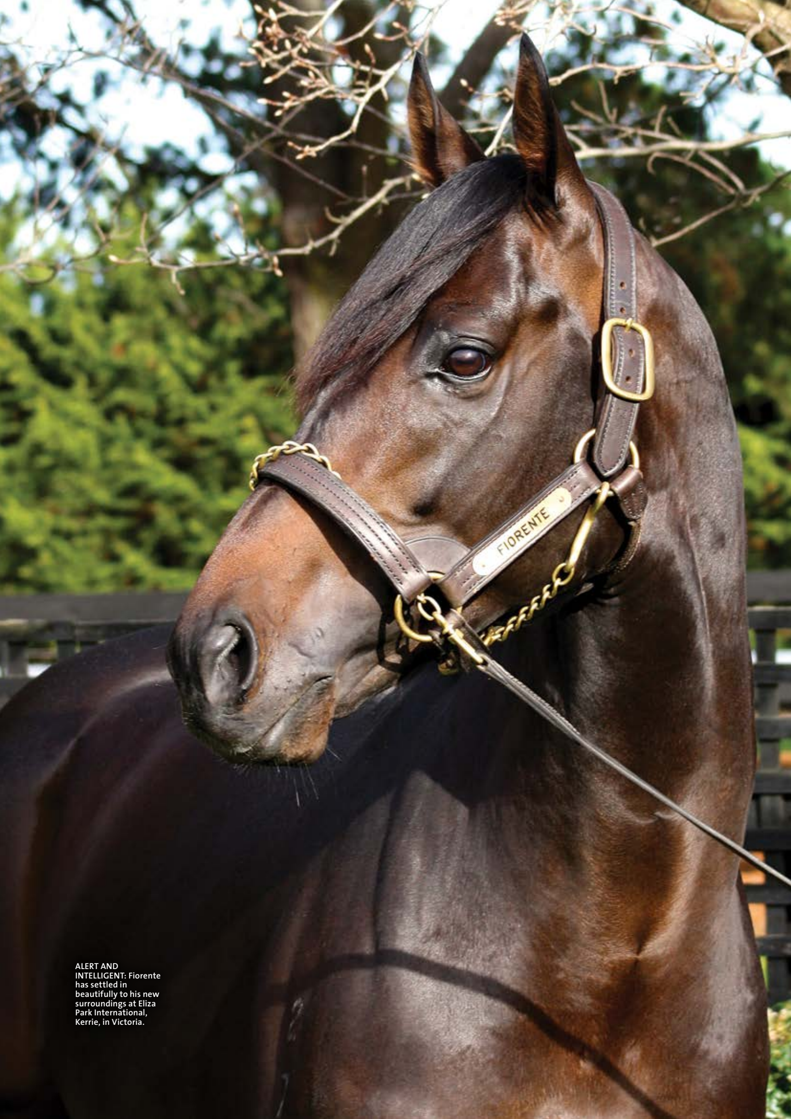
ALERT AND INTELLIGENT: Fiorente has settled in beautifully to his new surroundings at Eliza Park International, Kerrie, in Victoria.