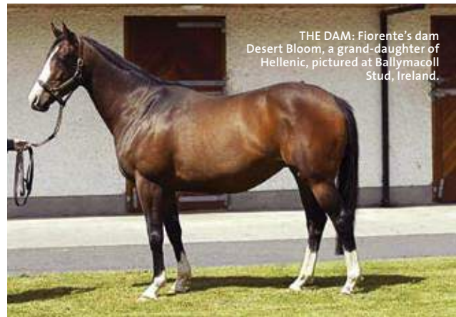
THE DAM: Fiorente's dam Desert Bloom, a grand-daughter of Hellenic, pictured at Ballymacoll Stud, Ireland.

Fiorente is the latest star Group 1-winner to come from the Hellenic line, and he's in a great place to continue her marvelous legacy.