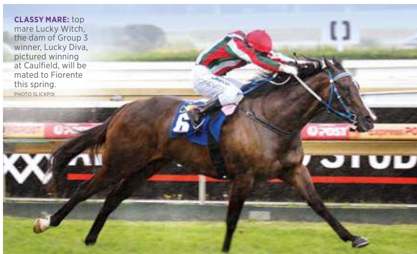
CLASSY MARE: top mare Lucky Witch, the dam of Group 3 winner, Lucky Diva, pictured winning at Caulfield, will be mated to Fiorente this spring.

One thing is for certain, there's going to be a whole lot of interest around the Eliza Park International barns at the 2017 yearling sales!