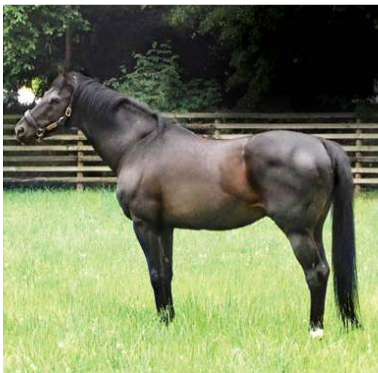
MONSUN: resting in his paddock in 2012, not long before his death.

Monsun broke the mould. Although in his early years he covered only small books—none of his first four crops numbered as many as 40—local breeders noticed he was delivering an extraordinarily high ratio of winners to runners. Before long, breeders elsewhere recognised there was also a significant proportion of high-class performers among his stock. After Shirocco's victories in the Breeders' Cup Turf and Coronation Cup it became obvious Germany was harbouring a sire of genuine