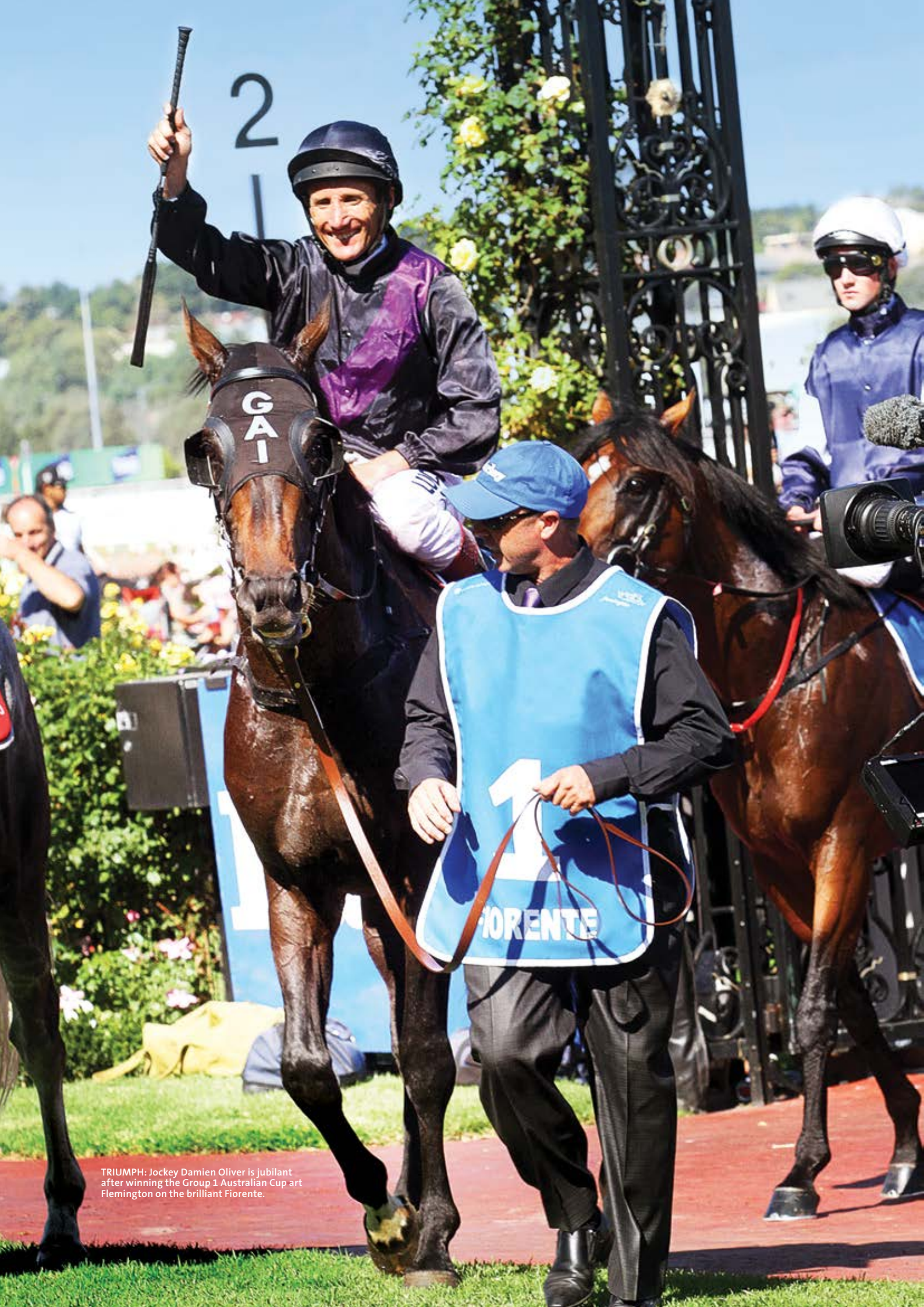
TRIUMPH: Jockey Damien Oliver is jubilant after winning the Group 1 Australian Cup at Flemington on the brilliant Fiorenze.